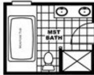
OPT. GLAMOUR BATH