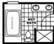
OPT. GLAMOUR BATH

3 beds • 2 baths • 1344 sq.ft. • 28' width • 48' depth